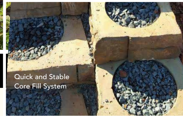
Quick and Stable Core Fill System

Introducing "The most attractive retaining wall block in the world." Traditionally, segmented retaining wall block products have only been offered in split-face or tumbled looks, which are institutional in appearance. Heritage Block is pleased to introduce an authentic and realistic retaining wall block that appears to be natural dry-stack stone available in six distinct colors.