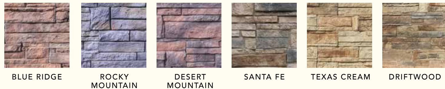
BLUE RIDGE ROCKY MOUNTAIN DESERT MOUNTAIN SANTA FE TEXAS CREAM DRIFTWOOD